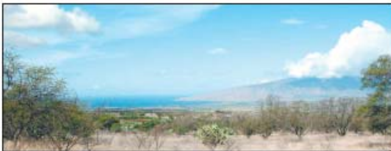
Lot D has ocean and mountain views.

Fed by a private well, Phase II will include two more storage tanks with 144,000 gallon capacity. Two storage tanks are already in place at Phase I. "The developer is looking to amend Maui Electric power with photovoltaic power for some of the pumps," said Phil during a re-